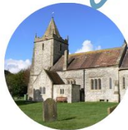
ALL SAINTS Corston

On the second Tuesday of every month I'm in St Mary's hall from 0930 - 1130