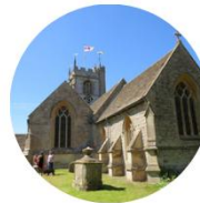
HOLY TRINITY Newton St Loe

On the first and third Wednesdays of every month I'm at All Saints coffee morning from 1030 - 1200