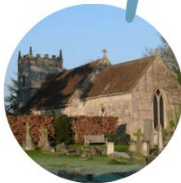
ST MARY'S Salford

On the second Tuesday of every month I'm in St Mary's hall from 0930 - 1130